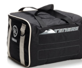
Inner Bag Top Case Ténéré

For all XT660Z Ténéré ABS accessories go to the website, or check your local dealer