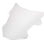
Headlight Protector XT660Z Ténéré