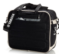
Inner Bag Ténéré Side Case