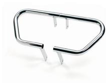
Engine Guard YBR125