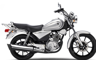
Light Grey Metallic