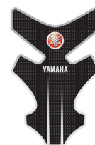
Tank Pad Yamaha

For all YBR125 Custom accessories go to the website, or check your local dealer